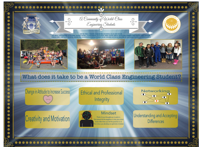
Figure 1. Poster presented by the students in the Engineering Residential College at the Great Ideas for Teaching and Learning Symposium at Boise State University, January, 2015.

academic honor granted to a BSU undergraduate student) ceremony, provided students with professional and academic role models. Students were loaned iPads (from the BSU Instructional Design and Educational Assessment shop) for use during their participation in the LLC, in order to facilitate the development of their digital fluency. Students used the iPad in class to interact with the lecture content, as well as completed assignments and homework.